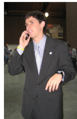
Reid on business for Biden in Des Moines, Iowa.

This was very tough turf, as this area is extremely politically conservative and is one that Obama lost badly during the primary. Race, guns and abortion were the main issues that our campaign had to grapple with.