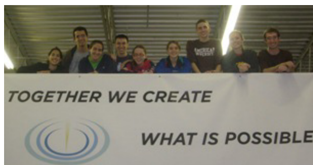
SHB members volunteer with the nonprofit A Wider Circle.

As always, we appreciate and welcome any and all comments, criticism, suggestions and concerns. Also, if you would like to help out with any of the events this semester – or help to plan others – please let us know!